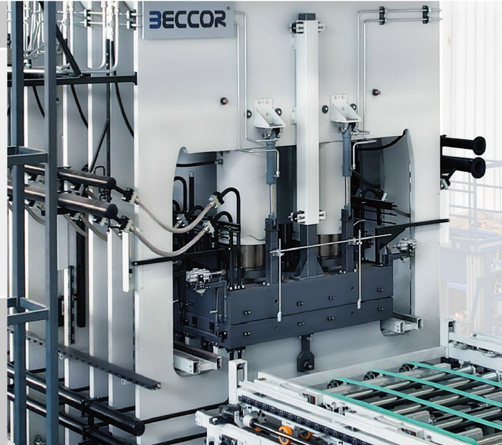
Professional Manufacturer of Press Machine Lines